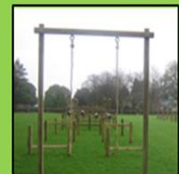
Adult Trim Trail