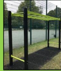
Adult Monkey Bar