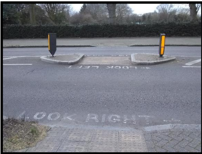
Pedestrian Island (£16,000)