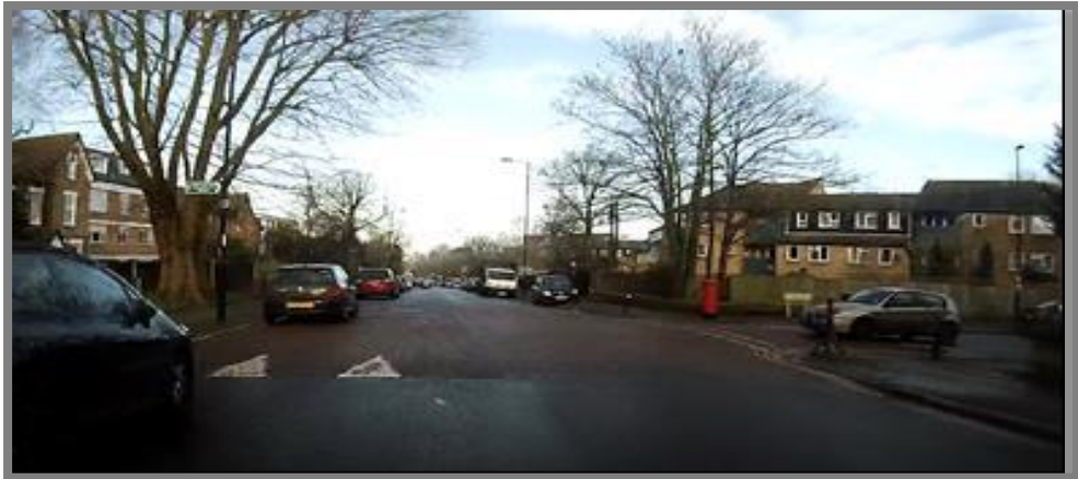
Speed table (£32,000)