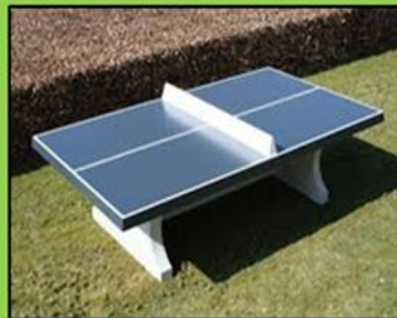
Table Tennis Table