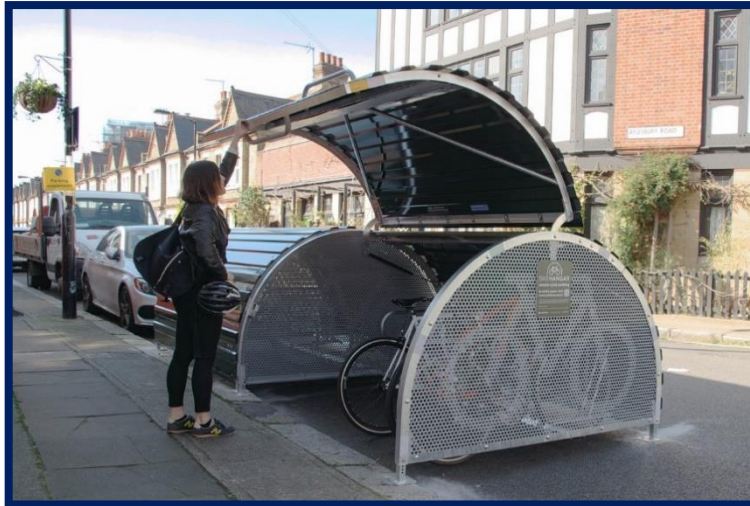
Secure Bike Hangar (£4,000)