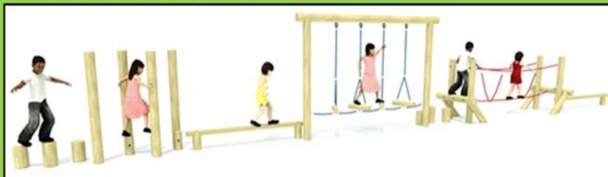
Outdoor Children's Trim Trail